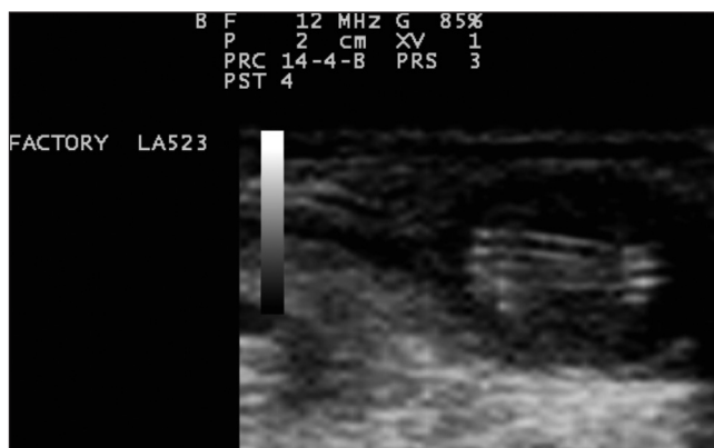
Figure 3 - Ultrasound of a skin nodule showing the typical double linear parallel hyperechoic structures.

microfilariae of D. immitis from those of D. repens . Species of microfilariae in the blood, in the pellet from Knott test or membrane from filtration test can be confirmed by specific PCRs.