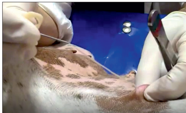
Figure 2 - Surgical removal of an adult D. repens from a skin nodule, using the mini-invasive technique.

The hallmark of diagnosis for subcutaneous dirofilariosis is the observation of microfilariae larvae in blood. In asymptomatic infections, this is usually an accidental finding during routine blood smears or during screening for D. immitis . It is important to be able to distinguish